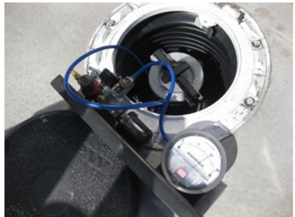
This spill bucket is undergoing vacuum testing.

Double-walled spill buckets have both primary and secondary containment, therefore most manufacturers require that a vacuum test be performed to ensure the integrity of the inner and outer wall. A hydrostatic test only ensures the integrity of the primary containment. Double-walled spill buckets are required so there will be secondary containment in place in case of a failure in the primary containment. For that reason, most spill bucket manufacturers will recommend testing both the primary and secondary containment through vacuum testing. Following this recommendation eliminates the possibility of a secondary containment failure that may go undetected if only the hydrostatic test were to be performed.